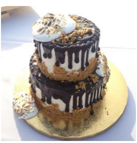
6", 12 servings, $75